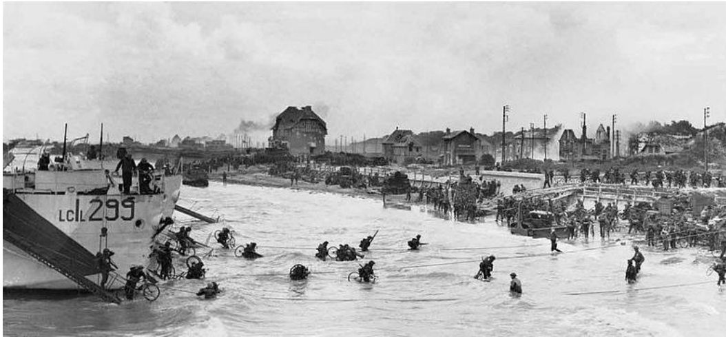
Canadian troops disembarking at Bernières, Juno Beach

Today's programme includes Ardenne Abbey, where some Canadian POWs were executed by SS troops, Bretteville Canadian War Cemetery in the Falaise area, and a visit to Caen, the city of William the Conqueror, carefully rebuilt after being destroyed during the fighting in 1944. Afternoon return to Honfleur and free time to explore this picturesque town on your own.