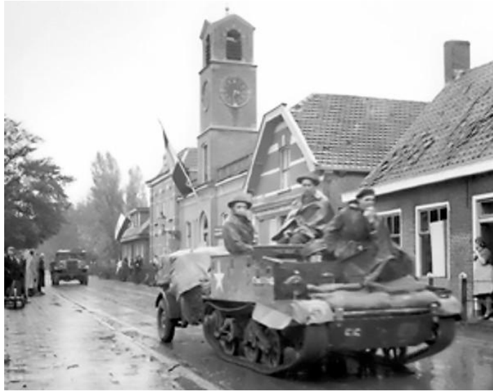
Canadians liberating a village in Holland

Pauwels Travel Bureau Ltd. 55 Dufferin Avenue, Brantford, Ontario N3T 4P6 Tel: 519-753-2695/519-756-4900 - Fax: 519-753-6376 tours@pauwelstravel.com – www.pauwelstravel.com