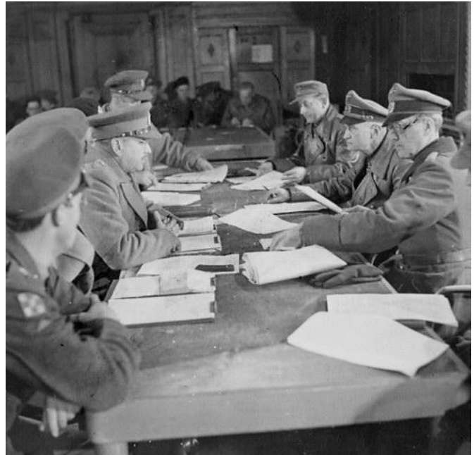
German surrender in Hotel De Wereld